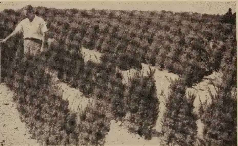
Taxus media Cedar Hill (foreground) Chamaecyparis plumosa . Plume cypress. Photo Sept. 1954

TAXUS media browni - Bush type. 18-24" ----- $3.25 2-2½' ----- $4.00